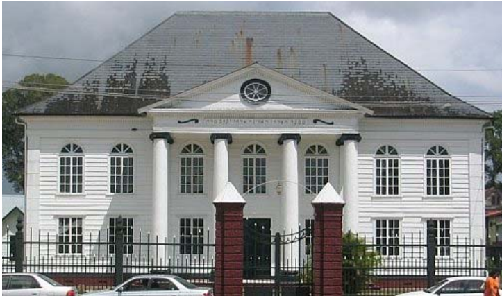
Neve Shalom Synagogue in Paramaribo, Suriname