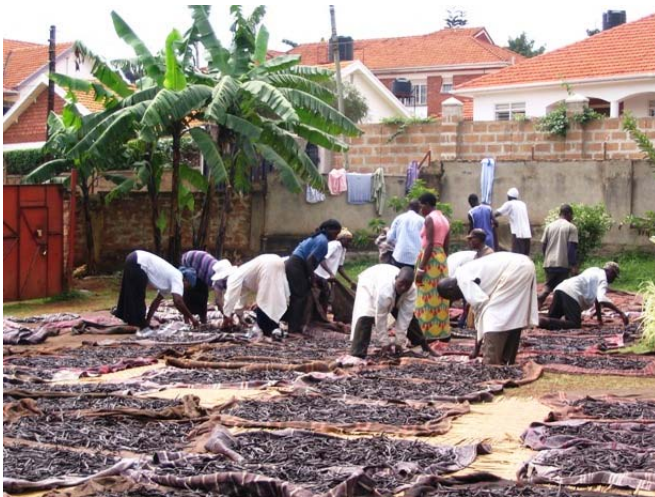
Delicious Peace Vanilla workers in Uganda