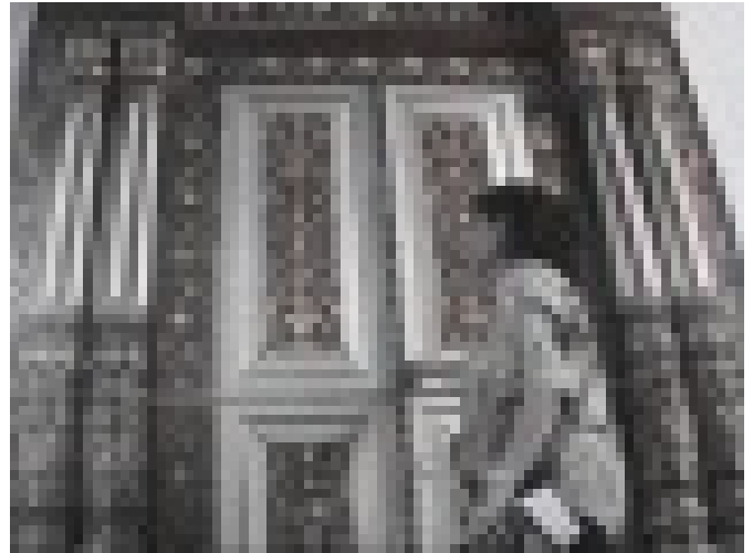
The author at the Ark of the former Kadavumbagam Synagogue

Once again we experienced reminders of India's rich Jewish history. Although the Kerala Jewish community has dwindled due to emigration, the synagogues remain and we are the richer for it.