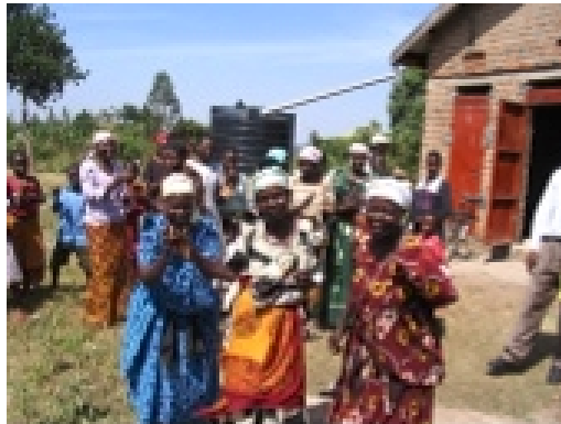
Abayudaya women with new water tank in the background