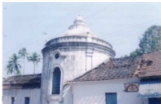
Chapel of Our Lady of Camdelaria Church on Divar Island, once probably a synagogue