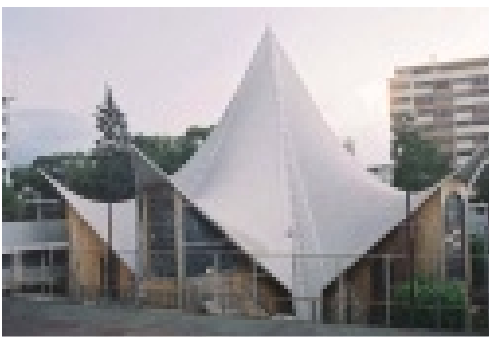
Shaarei Binyamin in Guatemala City

Outside of Mexico City and in small Central American countries such as Guatemala, the challenge of preserving Jewish tradition is huge.