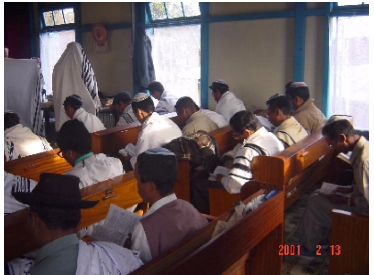
Bnei Menashe at prayer in India