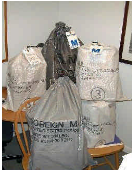
Jewish Books collected by the Epsteins await shipping to India.

To these generous members of the $100 club: the Fabrangens