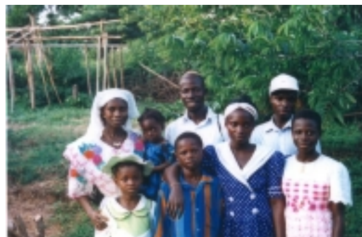
Sefwi Wiaswo family.