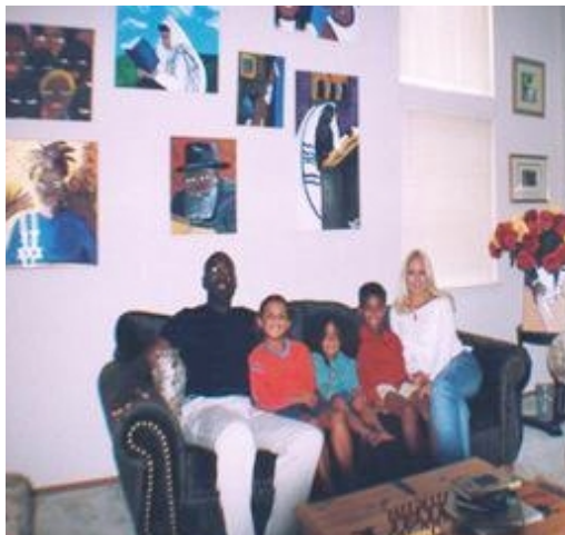
The author and her family with their "diverse" Jewish paintings

Now, it is 13 years and three beautiful Jewish boys later, and I am still in the middle of my journey. I have now added to my repertoire, as well as my home and friends' homes those precious heirlooms that I had always imagined. My house exudes the same level of tranquility as the one I grew up in, but with a new